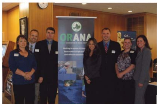
Board Members Represent ORANA at the February, 2013 Lobby Day