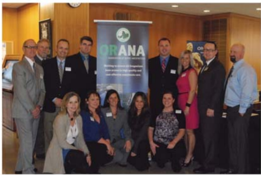
ORANA Represented at the February, 2013 Lobby Day